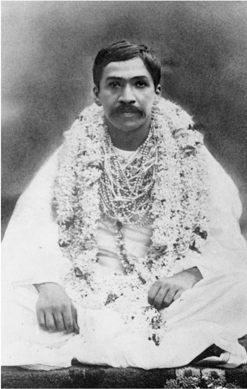
Sri Aurobindo in Calcutta on 23 August 1907, before giving the “Advice to National College Students” talk.