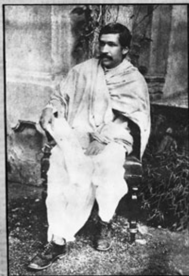
SJT. AUROBINDO GHOSE.