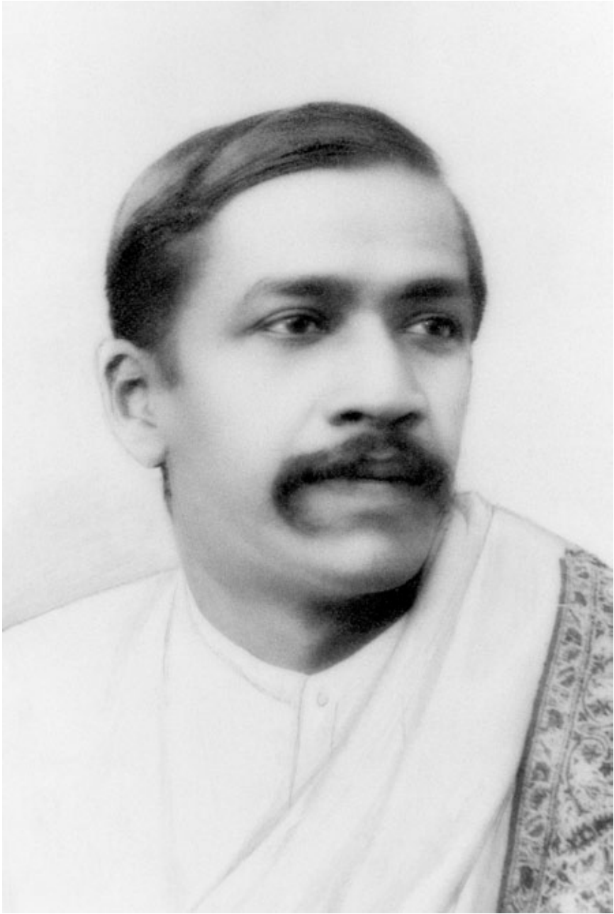
Sri Aurobindo in 1908