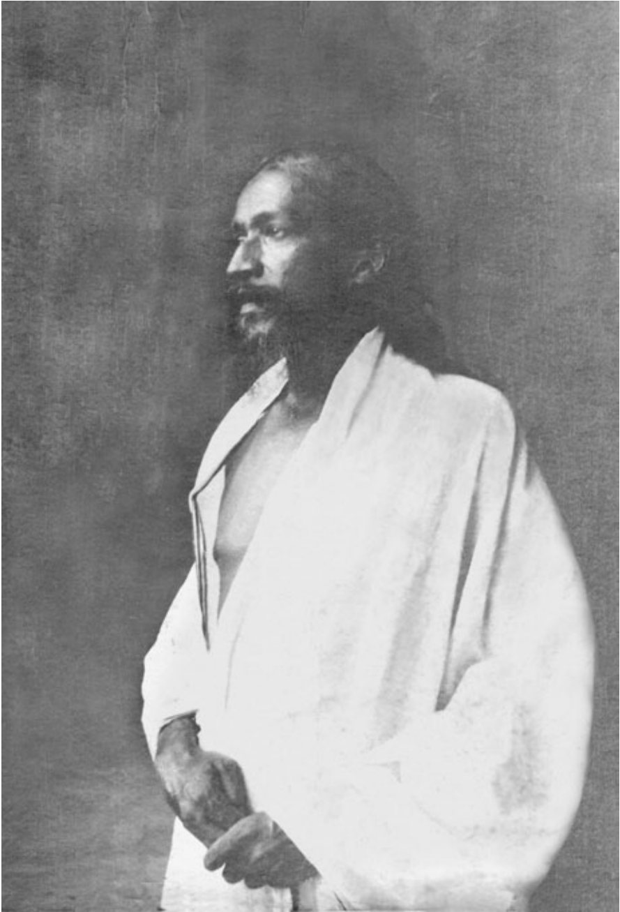
Sri Aurobindo in Pondicherry, c. 1915